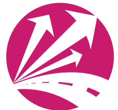
Advanced Improvement Projects