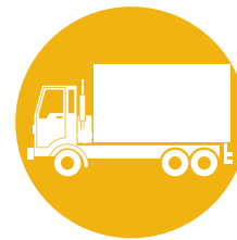
Commercial Vehicle Lanes Project