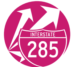
I-285 Advanced Improvement Projects