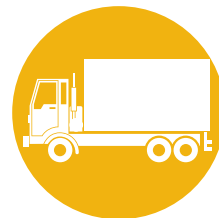
Commercial Vehicle Lanes Project