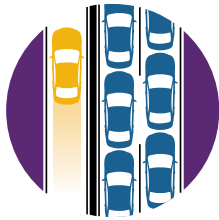
Major Express Lanes Projects