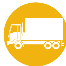
Commercial Vehicle Lanes Project